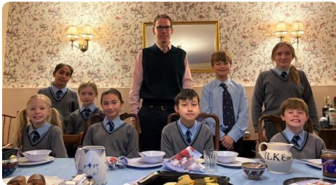
A Boarders' Breakfast